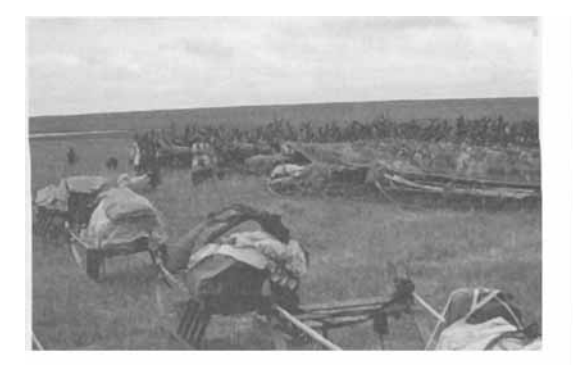
Nenets women rounding up reindeer on summer pasture near Kharasavey, Yamal Peninsula, August 1991. Animals are either lassoed on the run or herded into temporary corrals so they may be hitched to sledges for transport. Herders must move camp every 24–48 hours at this point in the migration to avoid having animals break through the thin cover of vegetation, which is already dominated by grasses and sedges due to long-term heavy grazing.