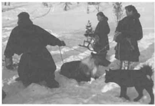
Ritual suffocation prior to reindeer slaughter at winter camp in forest-tundra near Nadym, Yamal region, March 1997. The practice of pagan rituals pertaining to animal slaughter appears more prevalent among people living mostly or entirely on the tundra compared to those in collectives and towns.