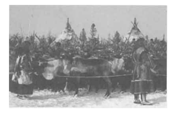
Nenets women rounding up reindeer in forest-tundra near Nadym, Yamal region, March 1997. Women and dogs do most of the work getting animals running and corralled, whereas men are responsible for lassoing and hitching animals to sledges.