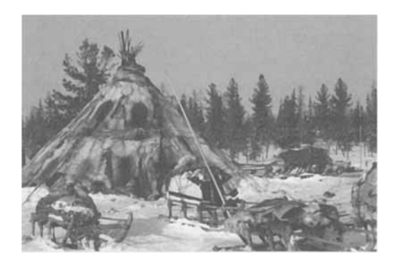
Winter Nenets camp near Nadym, Yamal region, March 1999. Note reindeer skins as covering for the tent ( chum ). In contrast to Finland, there is no "supplemental feeding" and animals must dig for lichens and other forage through snow that may be more than 1 m deep. Photo: B. Forbes.

Nenets herders' cemetery, Ob River delta, July 1996. Burials are above-ground due to continuous permafrost. The cross on the grave and the herder's overturned sledges reflect a mixture of Orthodox Christian and pagan beliefs. Photo: B. Forbes.