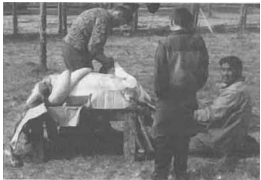
Skinning and butchering a reindeer at a collective farm near Naryan Mar, Nenets Autonomous Okrug, June 1996.