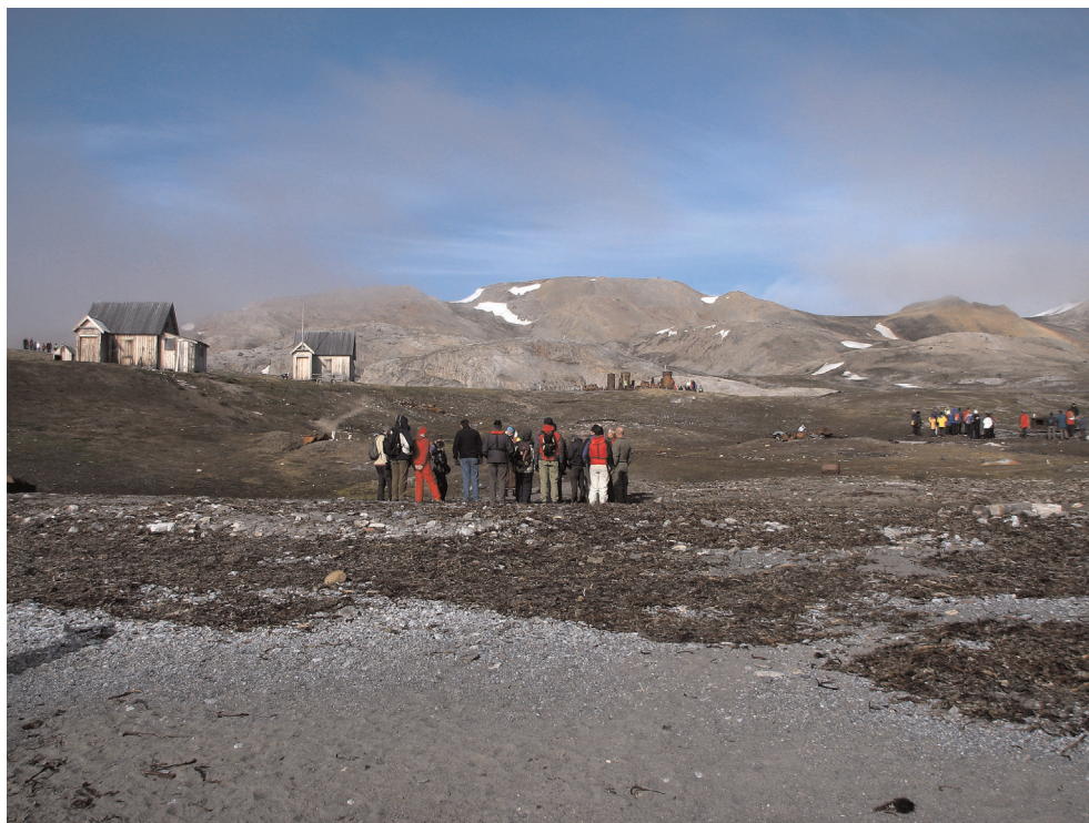
Fig. 4 London, in Kongsfjorden, is a fascinating site with remains from a rather unsuccessful and short-lived history of marble quarrying. The site has experienced increased visitor numbers during the last decade, and part of the site is very vulnerable to human traffic.