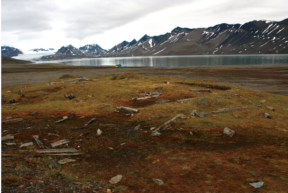
Fig. 3 Trygghamna, in the western part of Isfjorden, is one of the most popular landing sites in Svalbard and has experienced a marked increase in visitors since 2001. The site has diverse historic remains and nature qualities, but is not a particularly vulnerable site.