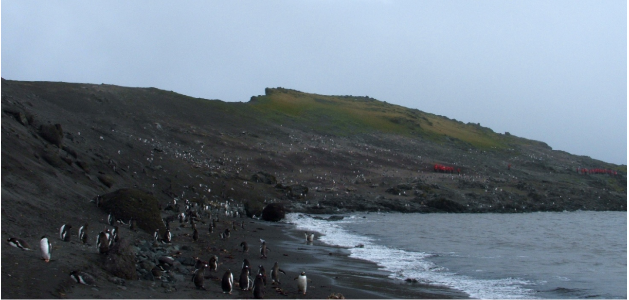
Supplementary Fig. S1. General view of Hannah Point (Livingston Island), as an example of the extent of vegetated areas in some of the sites studied. Note the people in the picture (in red) for scale.

Supplementary file for: Casanovas P., Black M., Fretwell P. & Convey P. 2015. Mapping lichen distribution on the Antarctic Peninsula using remote sensing, lichen spectra and photographic documentation by citizen scientists. Polar Research 34. Correspondence: Peter Convey, British Antarctic Survey, Natural Environment Research Council, High Cross, Madingley Road, Cambridge CB3 0ET, UK. E-mail: pcon@bas.ac.uk