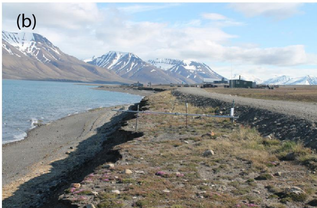
Supplementary Fig. S2. Images depicting the rapid removal of cliff sediments at Vestpynten during the spring melt season: (a) photograph taken 23 May 2012, with orange line showing the July edge as seen in (b), taken on 12 July 2012. Images taken by the automatic camera set up at Vestpynten by Emilie Guegan and the Sustainable Arctic Marine and Coastal Technology project WP6 concerning coastal technology.