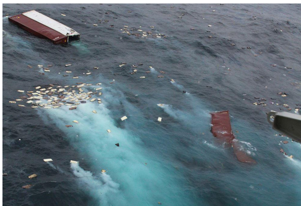
Fig. 2 Containers breaking up and releasing cargo. From the wreck of MV Rena , off New Zealand, October 2011.

Some of the chemicals transported are oil-soluble and float (Supplementary Table S1). Generally behaving like oil on the water, these chemicals will mix with the spilled oil and will be collected as the oil-chemical mixture is skimmed from the sea surface. A chemical that evaporates, dissolves or sinks cannot be mechanically recovered from the sea surface. The two non-oil-like substances of Oleum's cargo either dissolve (2,4,5-trifluorobenzoic acid) or sink (BDF-513; Supplementary Table S1). The acid will quickly dissolve in water. BDF-513 has a higher density than water, is insoluble and will therefore sink. It will spread over a smaller or larger area depending on the ambient conditions, and can theoretically be collected by dredging or be left in place.