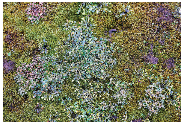
Fig. 2 Moss carpet with protruding common scurvygrass ( Cochlearia officinalis ), Lurøya, Tusenøyane, August 2018. Small holes in the moss carpet are caused by geese probing for Cochlearia roots.

Despite the functional loss of Tusenøyane as a breeding site for light-bellied brent geese, this has not caused a decline in the overall population size. On the contrary, the population as a whole has doubled within the last two or three decades, indicating that the population now recruits from remote but mainly unknown breeding grounds. The growth has taken place despite low and declining overall productivity (registered by age counts in the autumn flocks) but compensated by increased survival, which is suggested to be caused by improved food conditions and milder winters in the Danish/English wintering quarters (Clausen & Craggs 2018). Brent geese are known to breed scattered in low numbers in north-east Greenland (Boertmann et al. 2015), but, apart from that, there is little information about currently used breeding sites in Svalbard. From a conservation perspective, it is of high importance to identify the breeding areas to safeguard these from anthropogenic influences, such as disturbance from tourism.