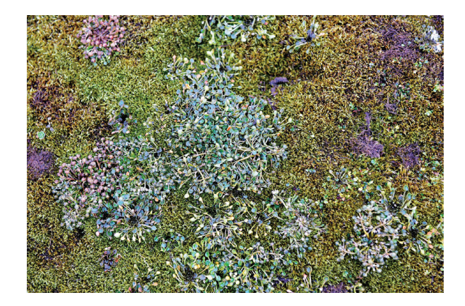
Fig. 2 Moss carpet with protruding common scurvygrass ( Cochlearia officinalis ), Lurøya, Tusenøyane, August 2018. Small holes in the moss carpet are caused by geese probing for Cochlearia roots.

Despite the functional loss of Tusenøyane as a breeding site for light-bellied brent geese, this has not caused a decline in the overall population size. On the contrary, the population as a whole has doubled within the last two or three decades, indicating that the population now recruits from remote but mainly unknown breeding grounds. The growth has taken place despite low and declining overall productivity (registered by age counts in the autumn flocks) but compensated by increased survival, which is suggested to be caused by improved food conditions and milder winters in the Danish/English wintering quarters (Clausen & Craggs 2018). Brent geese are known to breed scattered in low numbers in north-east Greenland (Boertmann et al. 2015), but, apart from that, there is little information about currently used breeding sites in Svalbard. From a conservation perspective, it is of high importance to identify the breeding areas to safeguard these from anthropogenic influences, such as disturbance from tourism.