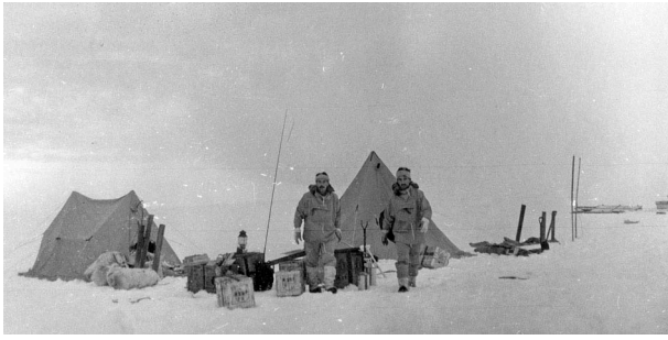
Figure 2. Photograph of the Argentine camp taken from the landed helicopter. Parts of the hut under construction and one of its walls can be seen in the background to the right.

the winter of 1958. Ventimiglia passed away on 18 May of that year during an emergency acute appendicitis surgery. His lifeless body was laid on a nearby glacier until the icebreaker ARA General San Martín transported him back to Buenos Aires to his final resting place (Pierrou 1981).