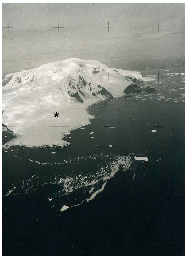
Figure 7. Peter I Øy from the north. Twistein Pillars is off the north-western tip of the island. The location of the Ventimiglia shelter is marked with an asterisk. (Norwegian Polar Institute, aerial photo archive: Peter I Øy, 1987, image no. 430.)

I thank the Dirección Nacional de Antártico, Instituto Antártico Argentino.