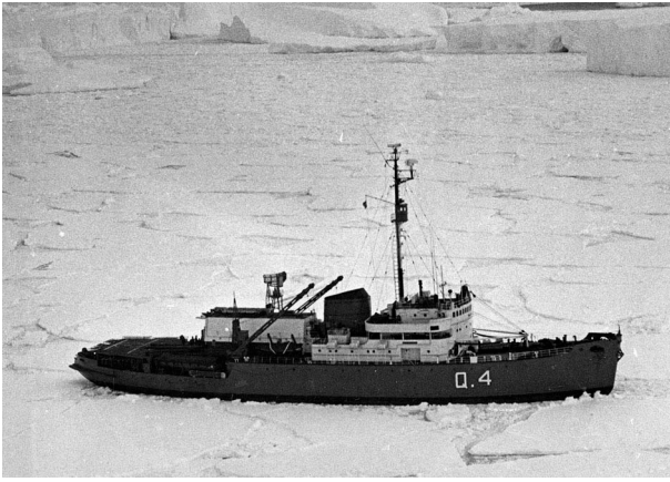
Figure 1. The icebreaker ARA General San Martín sailing in Antarctica.

Notwithstanding the difficulties, the Argentine Navy Antarctic Force proposed a logistic plan that included the use of the icebreaker ARA General San Martín (Fig. 1), as well as helicopters, to transport equipment from the vessel to the island (Estado Mayor del Grupo Naval Antártico 1964). The operation depended on the glacio-meteorological conditions and there was no assurance of external assistance in an emergency, as the icebreaker could be held up with other activities in the peninsula or Weddell Sea regions. The study concluded that the operation was not feasible and General Staff received the recommendation not to establish the station (Estado Mayor del Grupo Naval Antártico 1964).