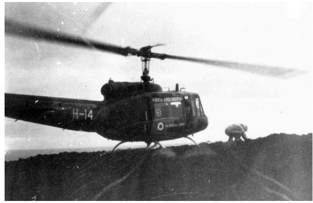
Figure 5. Landing on Twistein Pillars and collection of rock samples on 3 March 1971 at 11:00. The helicopter is a Bell UH-1H Huey from the 7th Brigade of the Argentine Air Force.