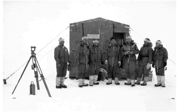
Figure 3. Inauguration of the Teniente (Lieutenant) Luis Ventimiglia hut on 3 March 1971 at 14:50.

Although the hut was located on an island which was claimed by Norway in 1931, the 1959 Antarctic Treaty allowed the construction of the facility. Set up outside of the Argentine Antarctic Sector, the hut was also outside of the Chilean territorial claim, which would help to avoid Argentina's South American neighbour from viewing it as an expansion into claim. Neither country has facilities established in the territory solely claimed by the other; instead, their respective facilities are within their own territorial claims or in the region in which both claims overlap. The hut was the only Argentine Antarctic facility outside of the territorial claim of the UK, which contains the Argentine