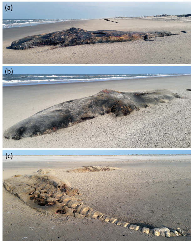
Fig. 1 Two sperm whales found by us on the Barents Sea coast near Tobseda. An arrow in (a) indicates the second specimen (b), about 180 m away. Photographs (a) and (b) were taken on 30 July 2018. (c) The same individual featured in (a) one year later: 22 July 2019 (the other individual was buried in sand).

sea (Batalikina et al. 2007). This record is nearly 1000 km from the nearest known sightings of sperm whales at sea (Fig. 2).