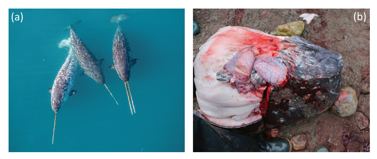
Fig. 1 (a) Double-tusked narwhal filmed from a drone near Qaanaaq on June 2021. (b) The head of the tuskless male (#1189) after harvest, with testicles placed on top of the animal.