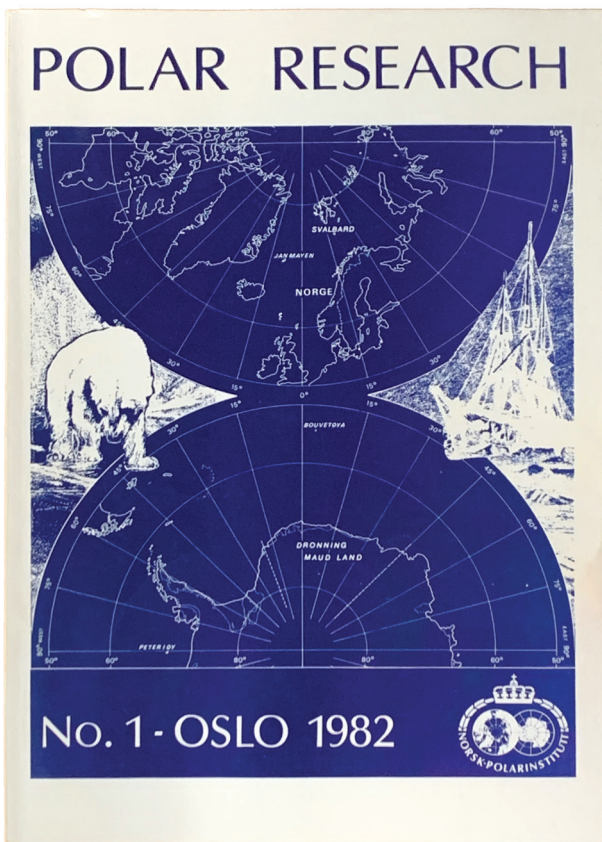
Fig. 2 The cover of the first issue of Polar Research , highlighting Norway's interests in Svalbard and Jan Mayen in the Arctic and, in the Far South, Dronning Maud Land and the islands of Bouvetøya and Peter I Øy.